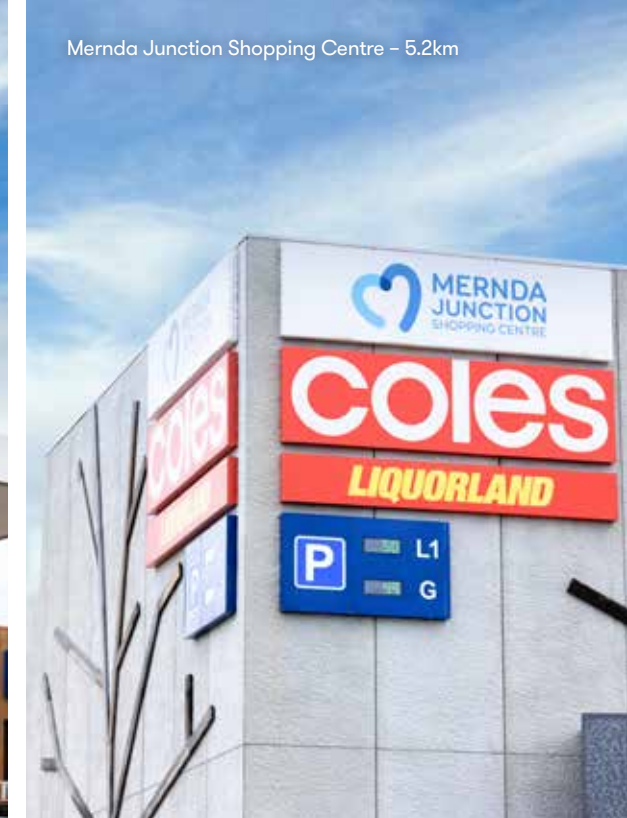
Mernda Junction Shopping Centre - 5.2km