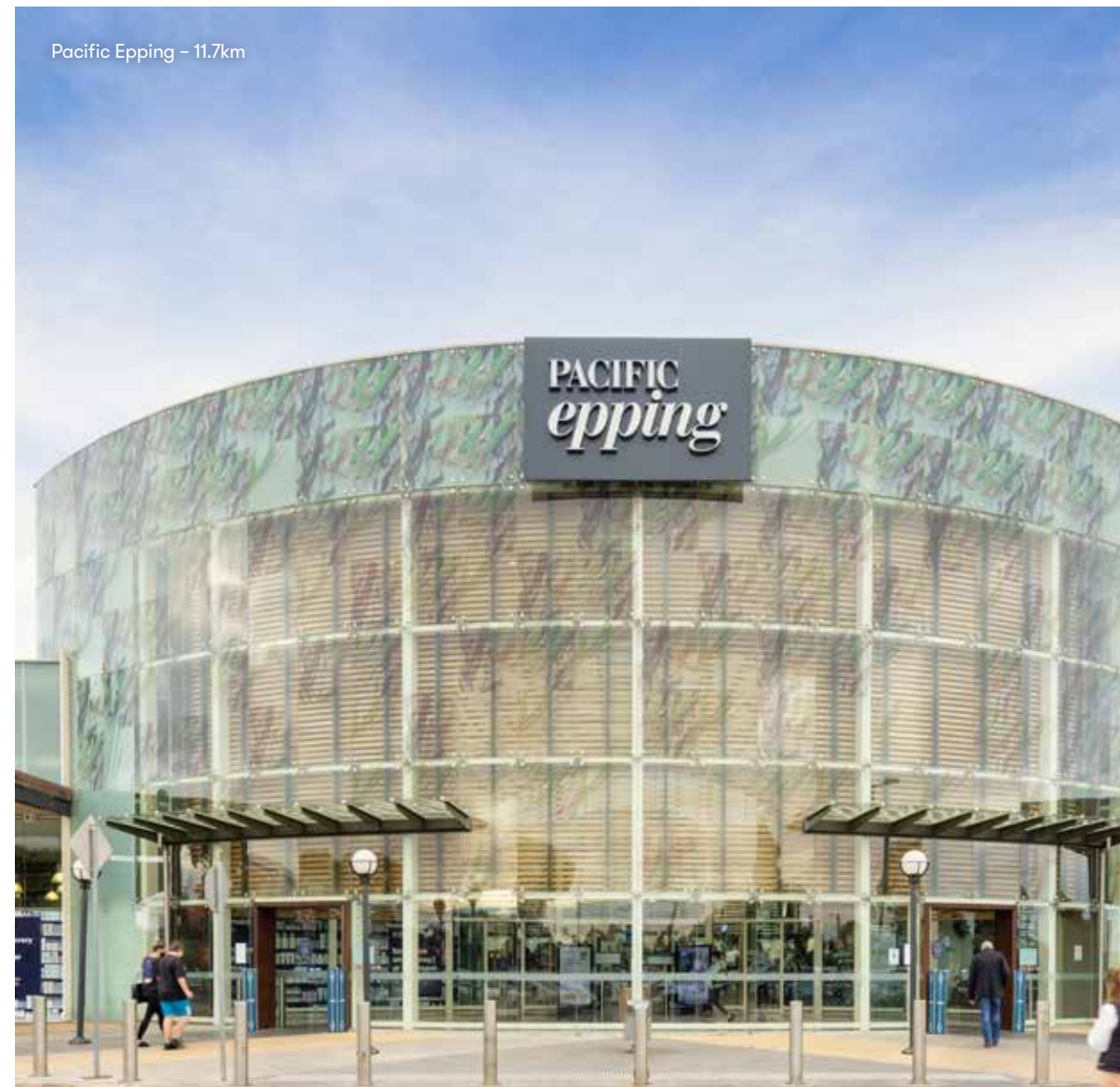
Pacific Epping - 11.7km