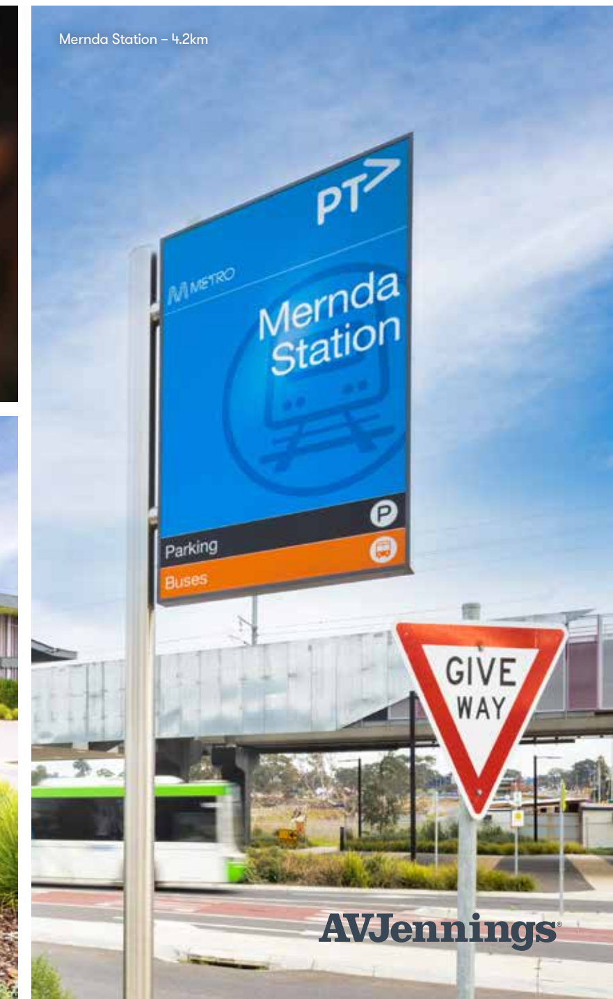
Mernda Station - 4.2km