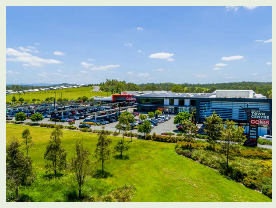
Ripley Town Centre.