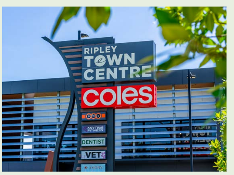
Ripley Town Centre.