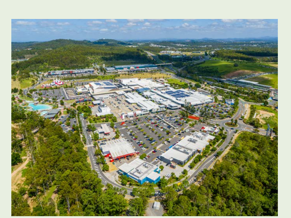
Springfield Central Station.

Discover convenience at its best, as everything you require is within easy reach. Yamanto Shopping Centre and Ripley Town Centre are both, less-than-5-minutes drive from your doorstep. Additionally, envision the luxury of strolling to your exclusive shopping destination, as our boutique community is set to feature it's very own shopping centre, approved and scheduled for construction soon.