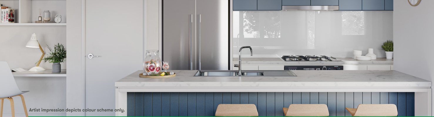
Artist impression depicts colour scheme only.