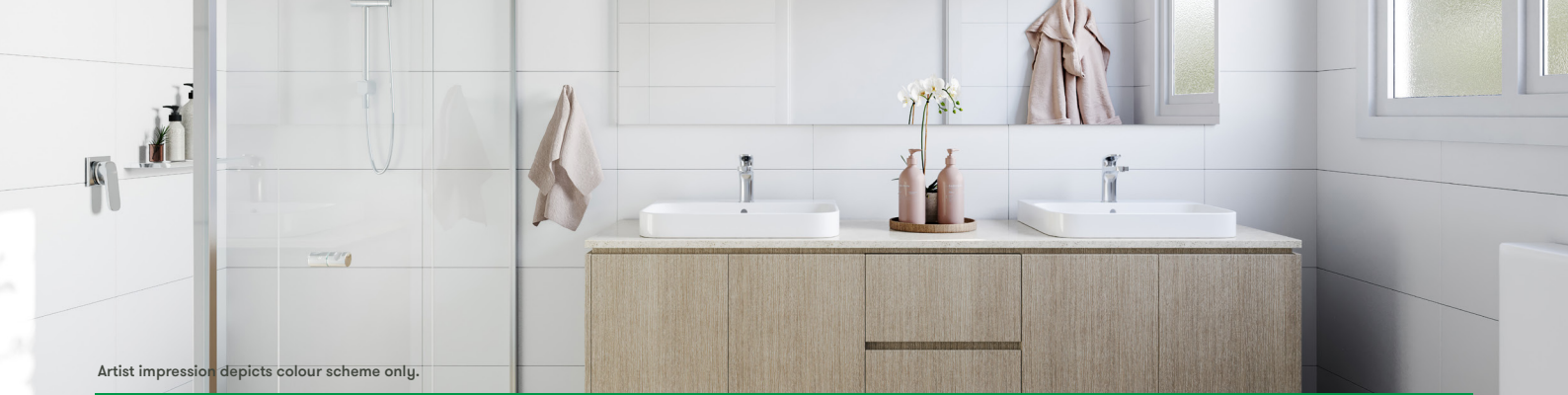
Artist impression depicts colour scheme only.