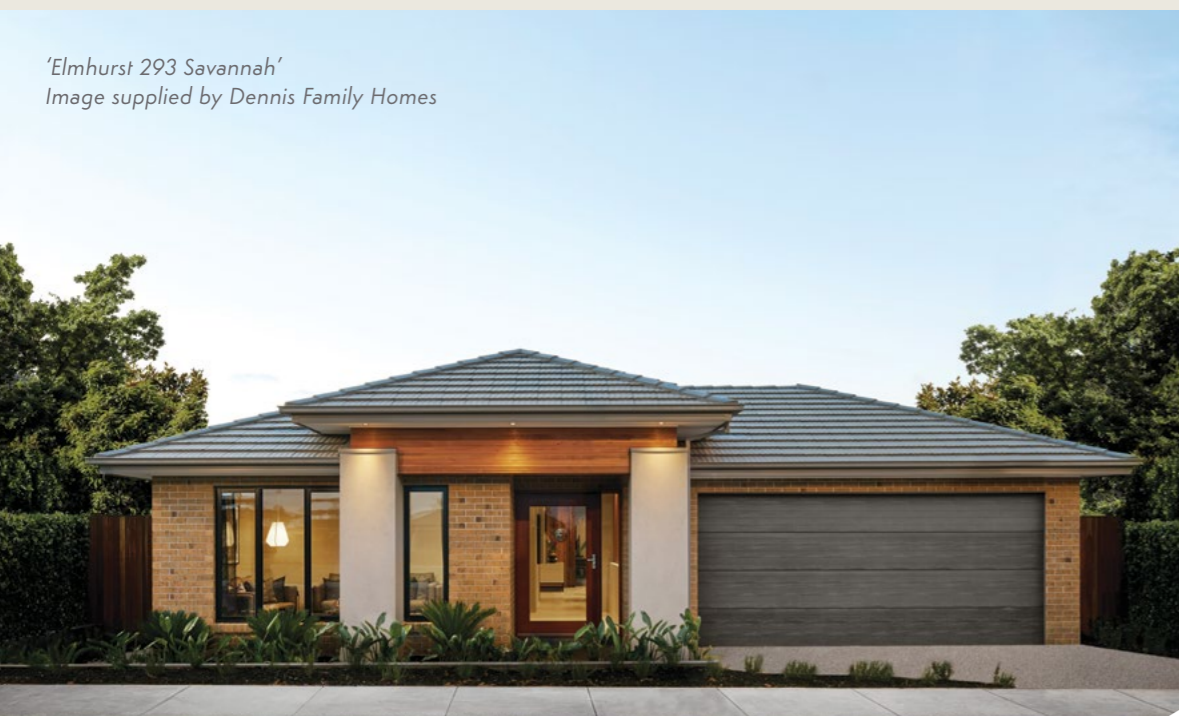
'Elmhurst 293 Savannah'

These Design Guidelines are subject to change without prior notice by AVJennings. All decisions regarding these controls are at the sole discretion of the DRC. For Integrated Medium Density Housing please refer to the Lyndarum North Integrated Development Design & Construction Principles.