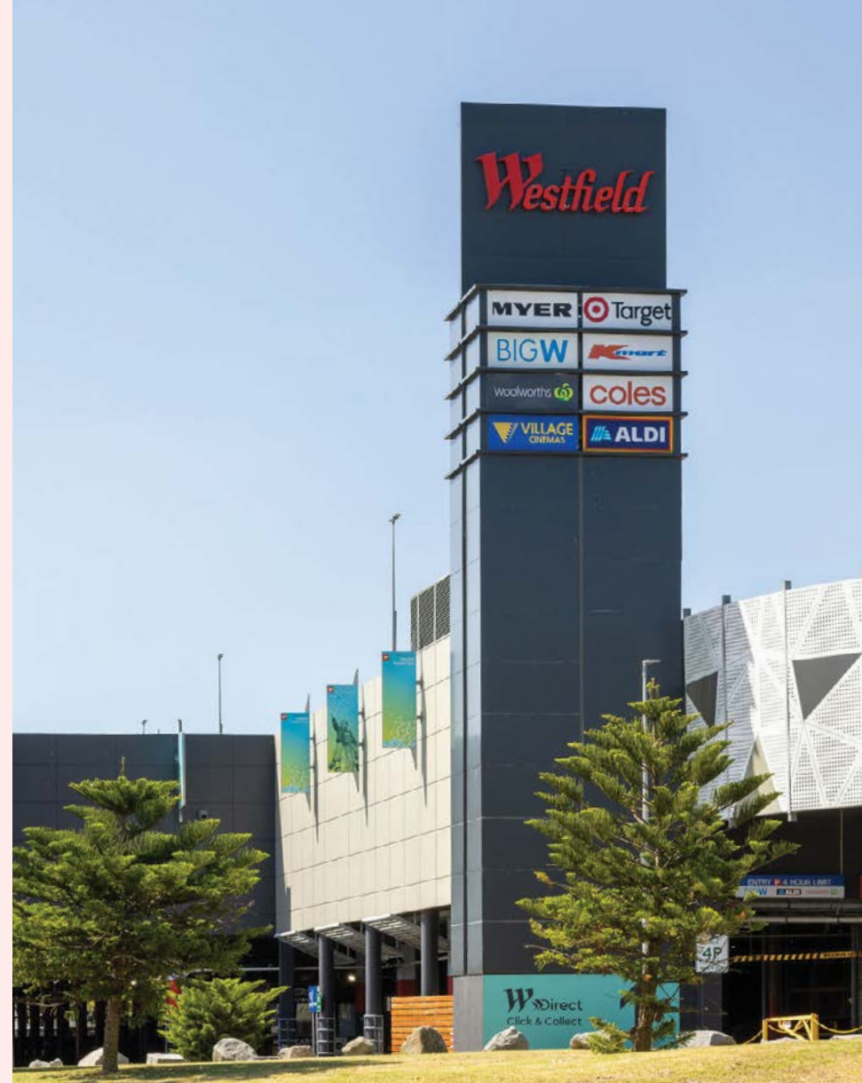
Fountain Gate Shopping Centre